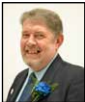
Councillor Chris Poulter Leader of Derby City Council

These pressures, combined with shortfalls from previous Government settlements, means we have increased Council Tax by 3.99%. This will increase payments by less than £1 a week for some taxpayers in the city. While this is not a decision we take lightly, 2% of the increase will be used to specifically support the investment that Adult's and Children's social care greatly needs.