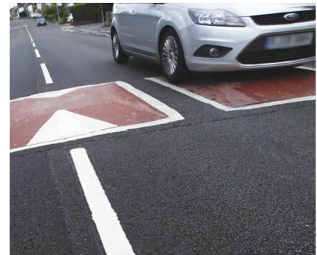
ROUND TOP ROAD HUMP