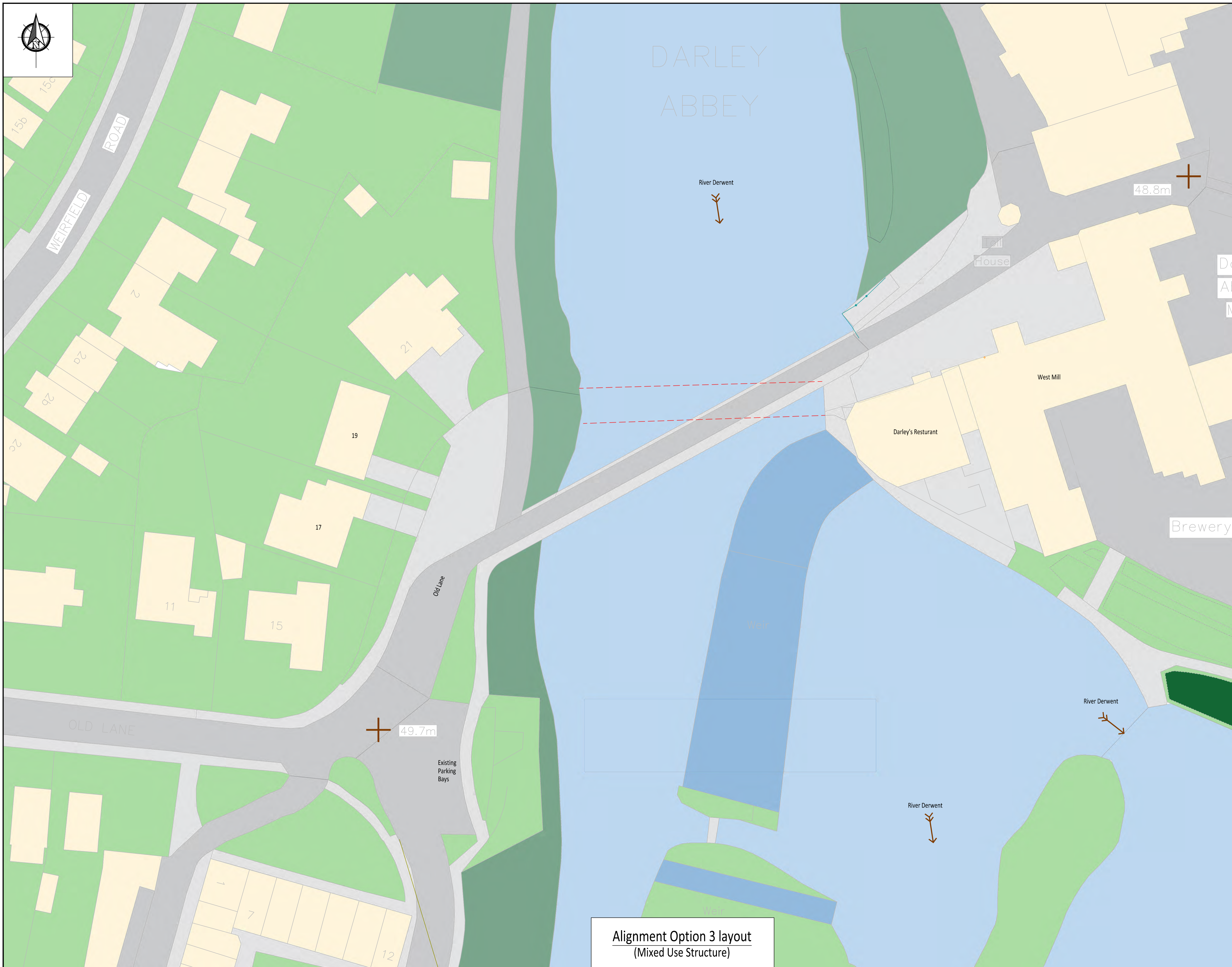
Alignment Option 3 layout (Mixed Use Structure)