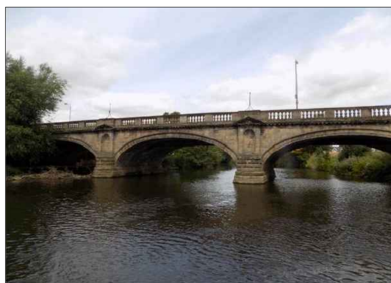
St Mary's Bridge Built 1794