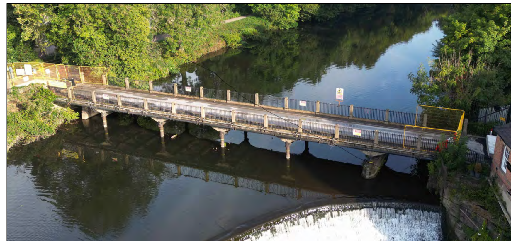
Darley Abbey Mills Bridge Built 1853 Re-decked 1936