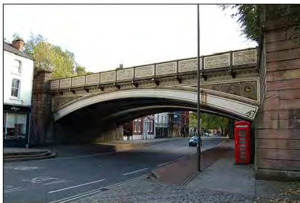
Friar Gate Bridge Built 1878