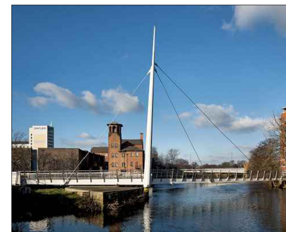
Cathedral Footbridge Bridge Built 2009