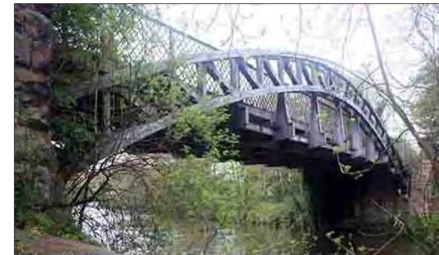
Handyside Bridge Built 1878