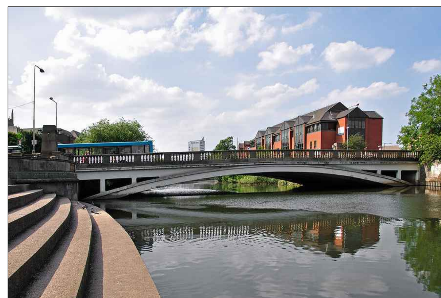
Exeter Bridge Built 1929